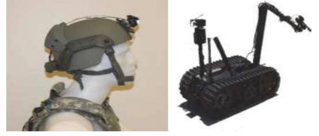
a) Soldier Electronics

Designers of defence systems are able to utilize wireless charging to improve the reliability, ergonomics, and safety of electronic devices. The Talon Teleoperated robot shown in Fig 3 is being equipped with wireless charging so that it can be recharged while it is being transported by truck from site to site. Helmet mounted electronics, including night vision and radio devices can be powered wirelessly from a battery pack carried in the soldier's vest, eliminating the need for disposable batteries or a power cord connecting the helmet to the vest mounted battery pack.